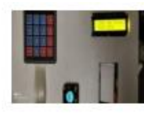
Fig.5.1. Hardware kit

The proposed framework improved the ease of use and high unwavering quality of the computerized lock framework utilizing IOT. The advanced lock framework assumes a critical part, to give the security and lessen the HR in the brilliant home and building mechanization situation[6]. The proposed strategy is executed the computerized lock framework, to guarantee the security, for an approved and the visitor client. We tried the security viewpoints in the distinctive climate. It is decreased the human labour, and furthermore it is given greater security, for the brilliant home and building mechanization applications