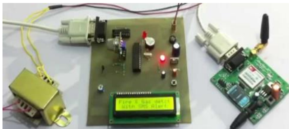
Fig.4.1. Hardware kit

We have used various components in the IOT and Arduino based FIRE AND GAS leakage detection system. FIRE AND GAS, Gas Sensor is used to detect the gas leakage. Arduino is used to turning ON the buzzer, to send a message to LCD and to send data to the IOT module. LCD is used to display an informative message. A buzzer is used to signal the gas leakage. And ESP8266 is used to send data over a Wi-Fi network.