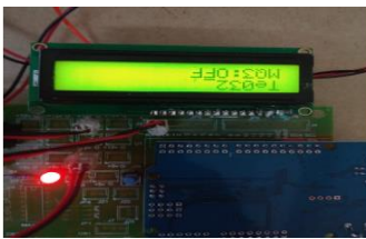
Fig.2. LCD display parameters