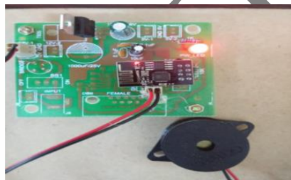
Fig.3. WIFI module